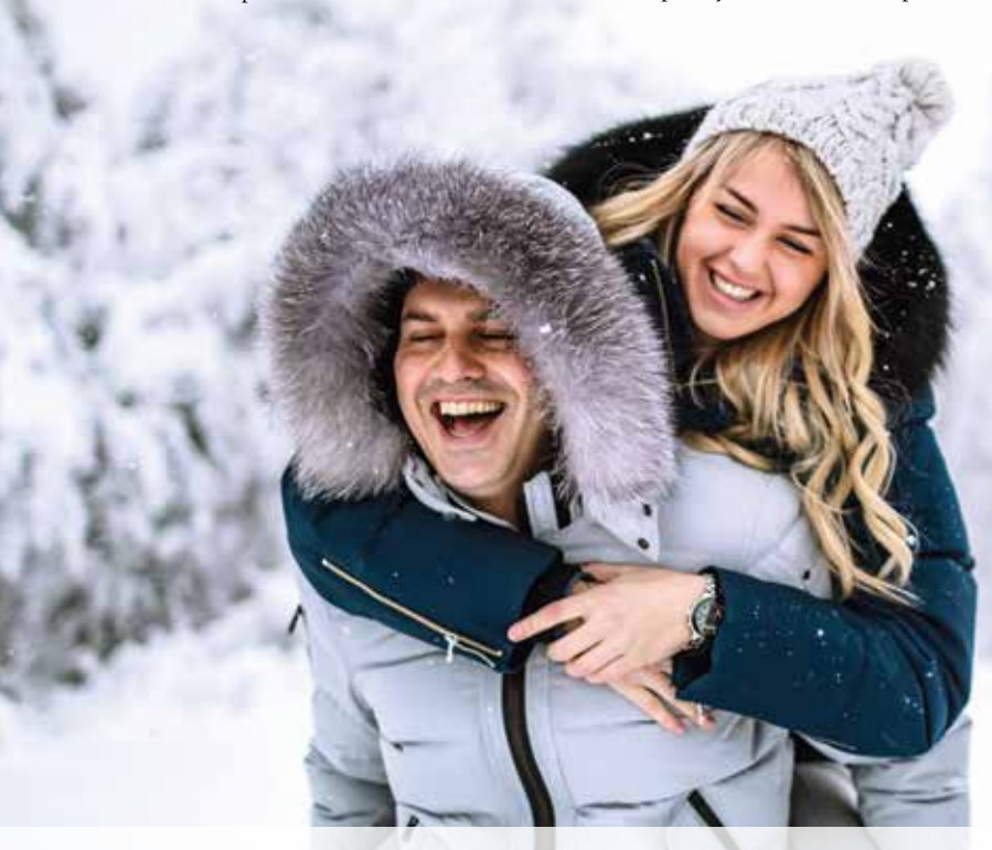
Information in the publication is the opinion of the authors. Personal decisions regarding health, finance, exercise, and other matters should be made after consultation with the reader's professional advisers. All models used for illustrative purposes only. All editorial rights reserved. Developed by Krames.